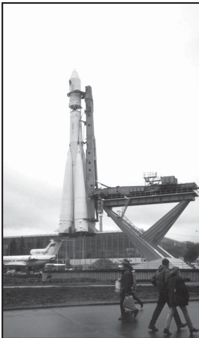
Figure 2. Vostok rocket that launched first cosmonauts into space on display in Moscow (photo taken in 1999).

The list of presents 14 to the first cosmonaut, Gagarin, included everyday items readily available at that time in the United States to broad segments of the population. The presents ranged from a television set, washing machine, refrigerator, and vacuum cleaner to most private items, such as underwear and socks. (The price of television sets or refrigerators was a few average monthly salaries.) The list also included presents for Gagarin’s wife and children, his mother, father, and monetary gifts to his brothers and sister. Gagarin and his family were expected to use the new