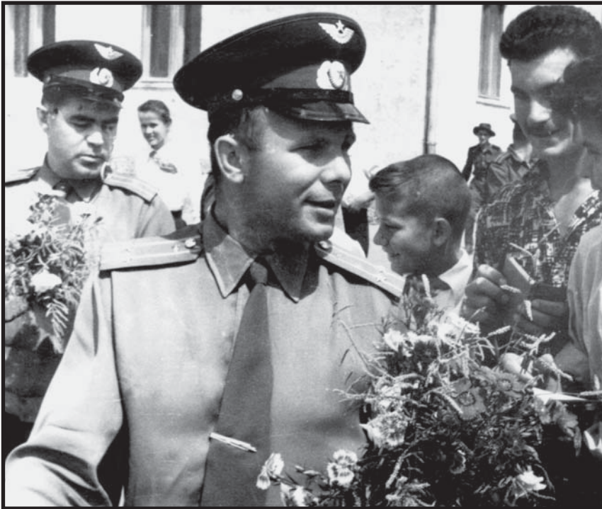
Figure 3. First cosmonaut Yuri A. Gagarin in Tyuratam (Baikonur) on 12 June 1963, more than two years after his historic spaceflight. Gagarin is in the uniform of an Air Force lieutenant-colonel. Major Andrian G. Nikolaev, the third Soviet cosmonaut ( Vostok 3 ), is on the left.