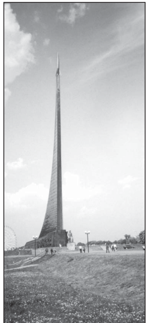
Figure 1. Monument to the conquerors of space opened in Moscow in 1964 (photo taken in 2001). The upper 99-m (325-ft) part of the monument is made of titanium and steel; the rocket on the top is 11 m (36 ft) tall.

Soviet cosmonauts projected the happy image of the Soviet Union. They inspired pride in ordinary Soviet citizens at home and emphasized the ideological superiority of the communist system abroad. The cosmonauts had to look good and neat, which posed special challenges in a country with never-ending shortages of everything.