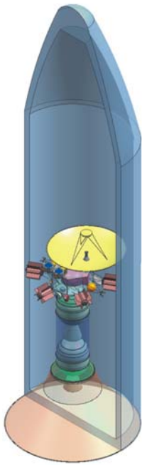
Figure 2. Innovative Interstellar Explorer under the shroud of the launch vehicle.

We base our mission on a launch by the existing NASA heavy launch vehicle such as Atlas V 551 – Star 48V which should place the spacecraft in Earth escape with C3 \sim 125 \text{ km}^2/\text{s}^2 . A Jupiter gravity assist adds \sim 25 \text{ km/s} and a realistic electric propulsion system provides an equivalent of 15 \text{ km/s} . The launch is optimized for a 1 kW electric thruster system (about the maximum power that can reasonably be supplied by RPSs) and generous (and likely prudent) mass margins. To reach the required large escape velocity, two stacked Star 48A solid rocket motors are used. They and the associated adaptors easily fit within the shroud of the existing heavy launch vehicles (Fig. 2). By requiring existing launch hardware, the new flight qualifications are minimized to those for this launch combination and RPSs optimized for mass-to-power output.